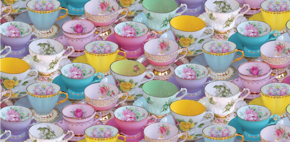
DP24895-10 Teacups-White Multi