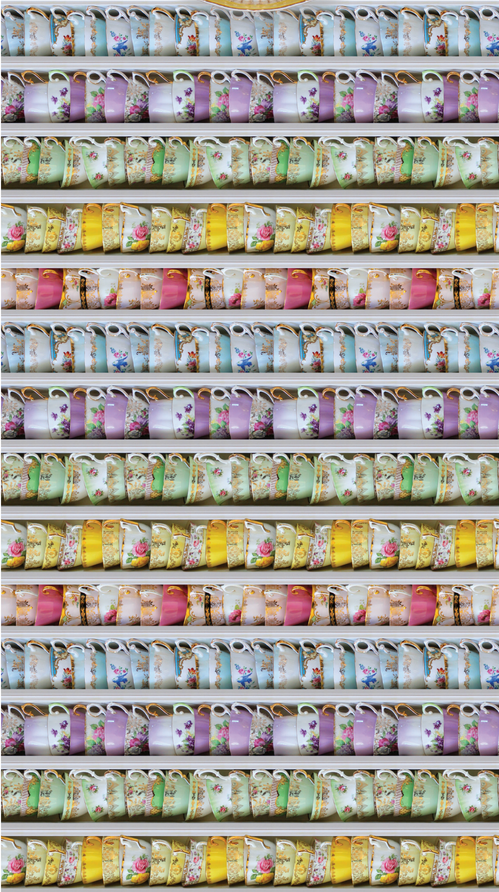
DP24894-10 Teacup Stripe-White Multi