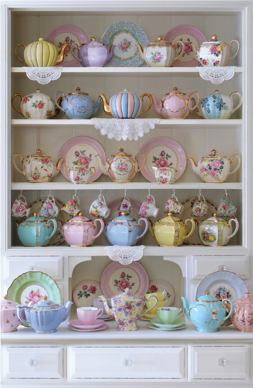
DP24893-10 Tea for Two Panel-White Multi