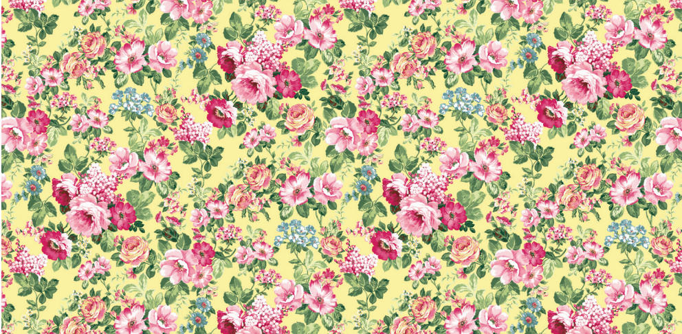
24897-52 Feature Floral-Yellow Multi