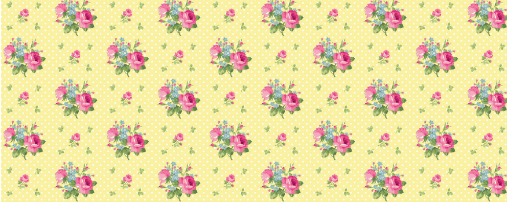
24898-52 Small Rose-Yellow Multi