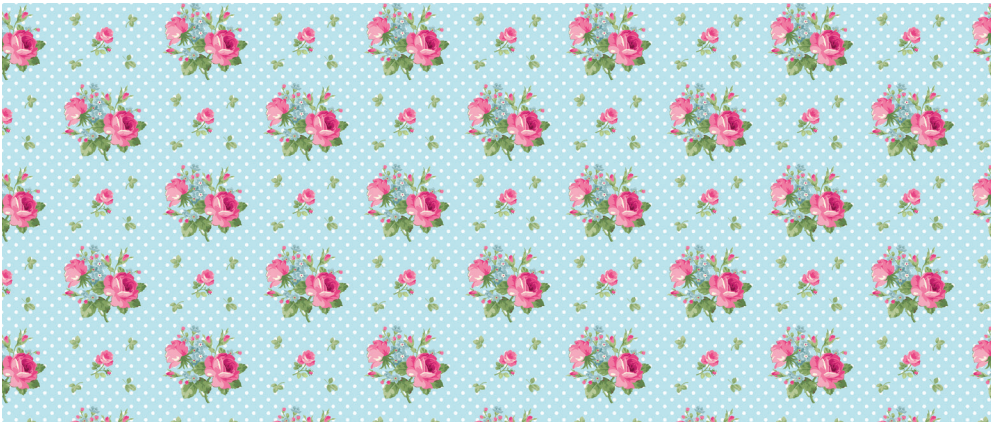
24898-42 Small Rose-Light Blue Multi