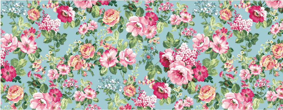
24897-44 Feature Floral-Blue Multi