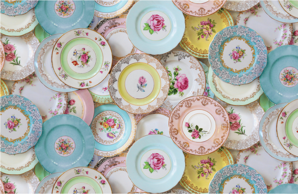
DP24896-10 Tea Plates-White Multi