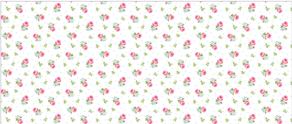
24899-10 Calico Mini-White Multi