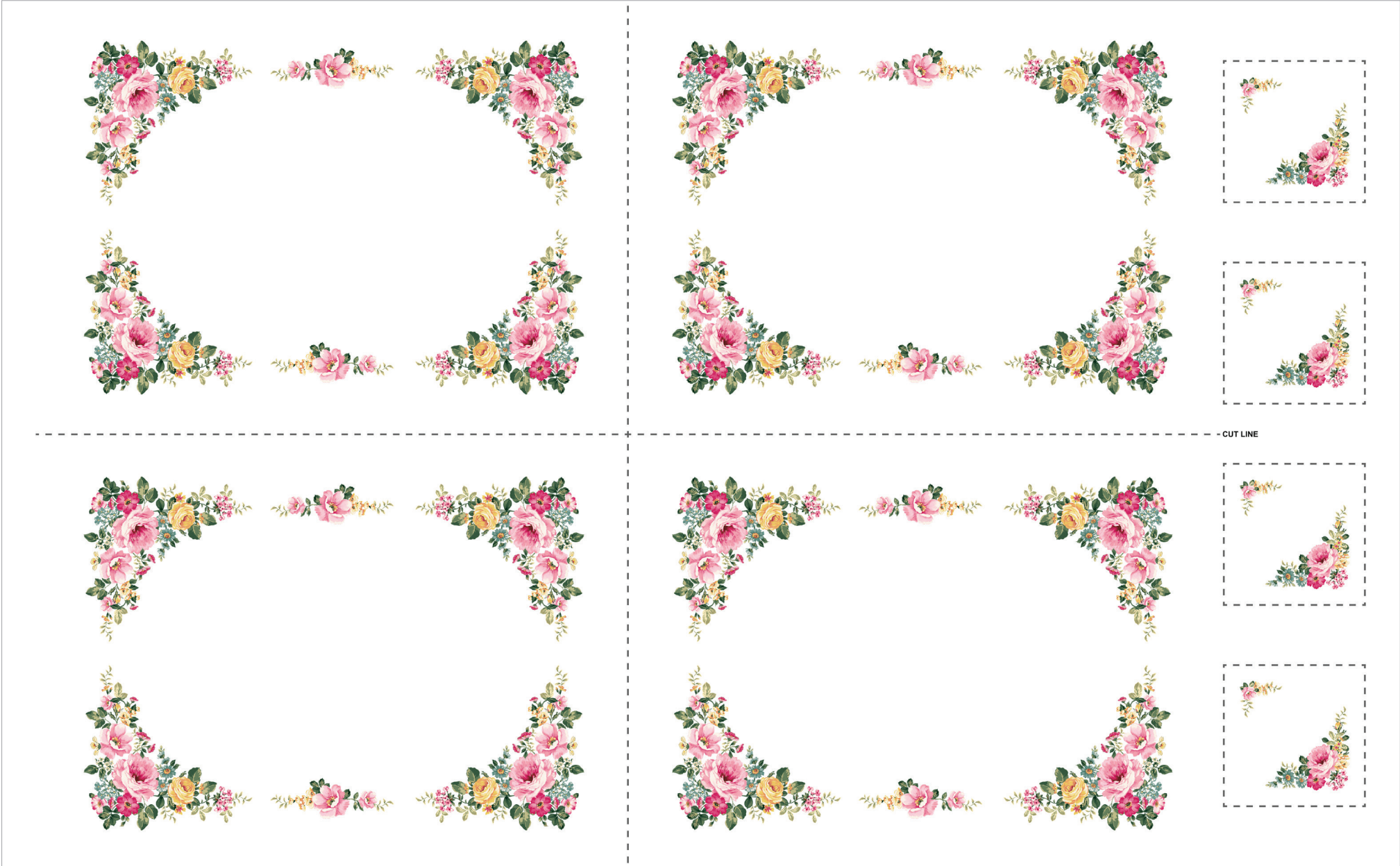
DP24903-10 Placemats-White Multi