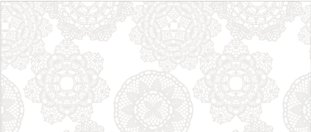
24902-10 Doilies-Pigment White