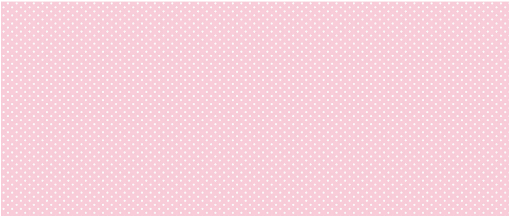
24900-21 Swiss Dot-Pink